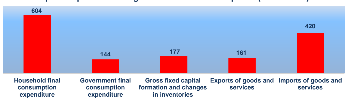
Graph 1. Expenditure categories of GDP at current prices (in mill. EUR)